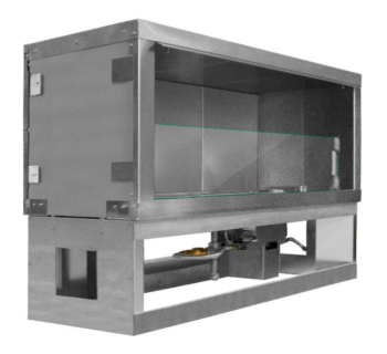
72" - RFP72LECONLED 65,000 Total BTU's

See-Thru Conversion: RFP-78006 Weather Cover: RFP-60COV LP Conversion: RFP60LECOLPK Glass/Media Needed: 25 Lbs