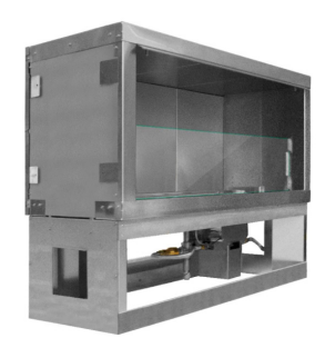
48" - RFP48LECONLED 43,500 Total BTU's

See-Thru Conversion: RFP-78002 Weather Cover: RFP-36COV LP Conversion: RFP36LECOLPK Glass/Media Needed: 15 Lbs