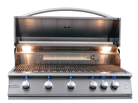
40" Premier Grill - RJC40AL Upgraded with Dual Interior Halogen Lights & LED Illuminated Control Knobs.