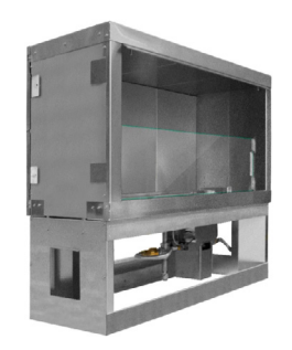
36" - RFP36LECONLED 31,000 Total BTU's

See-Thru Conversion: RFP-78002 Weather Cover: RFP-36COV LP Conversion: RFP36LECOLPK Glass/Media Needed: 15 Lbs