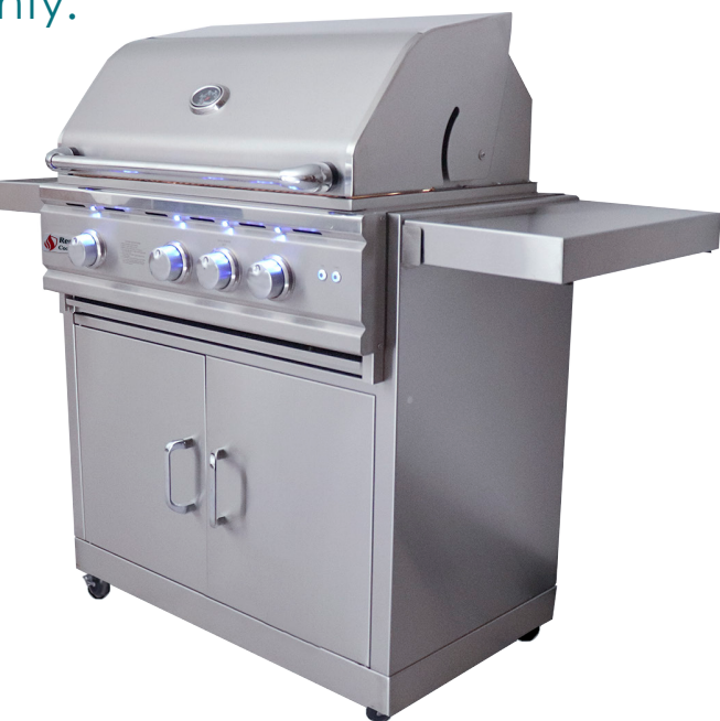
Shown RON30A & RONMC