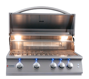
32" Premier Grill - RJC32AL Upgraded with Dual Interior Halogen Lights & LED Illuminated Control Knobs.