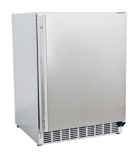
24" Refrigerator - REFR2A Trim Kit: RTR2

4.5 Cu. Ft., reversible 304 stainless steel locking door, interior light, one drawer, automatic defrost, can holder, adjustable shelves & thermostat. Overall: 32 1/2"H x 20"W Optional door upgrade: SSFDLB / SSFDLRB