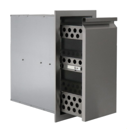
Spice Drawer VSD1

Overall: 33"W x 20 1/2"D x 22"H Two fully enclosed soft close drawers, storage door, unit is reversible.