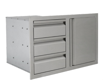
Three Drawer/Door VDC2

Overall: 17"W x 20 1/2"D x 22"H Fully enclosed, soft close two drawer unit.