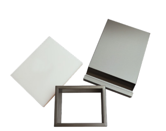
Trash Chute & Cutting Board VTC1

Overall: 14"W x 19 3/4"D x 26 1/2"H Includes one 13 gal plastic bin.