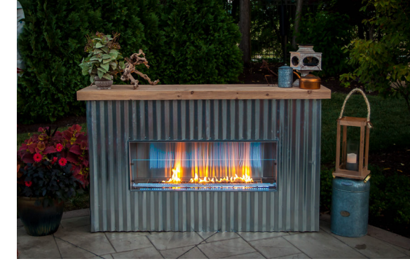
Make a modern statement with the Cedar Creek LED outdoor linear gas fireplace. Designed with a clean and contemporary style in mind, no chimney or venting required makes it an ideal product for quick & efficient framing & finishing. Over 16 million LED colors to choose from.