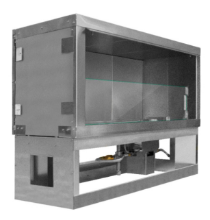
60" - RFP60LECONLED 50.000 Total BTU's

See-Thru Conversion: RFP-78004 Weather Cover: RFP-48COV LP Conversion: RFP48LECOLPK Glass/Media Needed: 20 Lbs